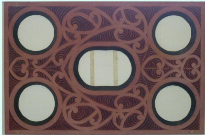
The carved picture frame